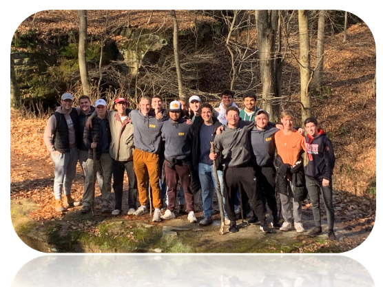
"The beauty of genuine brotherhood and peace is more precious than diamonds or silver or gold."

and chicken sandwiches. As the sun set each night, we found ourselves circled around the bright, warm campfire. After sharing stories and cracking some jokes, it was time for a late-night horror film. Following the jump scares, it was time for bed - that is if the sound of someone snoring in the bottom bunk does not keep you awake. All in all, it was an amazing retreat filled with many laughs, heartfelt moments, and lifelong memories.